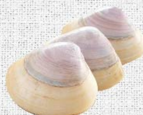
贵妃蚌 Royal Mussels 时价 Market Price

图片只供参考。所有价格均以澳门元计算，并附加10%服务费。如对任何食物有过敏反应，请于点餐前通知服务团队。 Photos for reference only. All prices are in MOP and subject to a 10% service charge. Please inform the service team of any food allergy or dietary requirements prior to ordering.