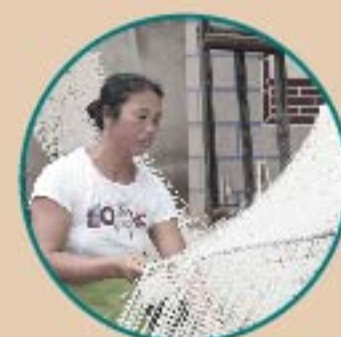
6 莆田黄石镇 妈祖面线 Huang Shi Town in Putian City Mazu Mee Sua