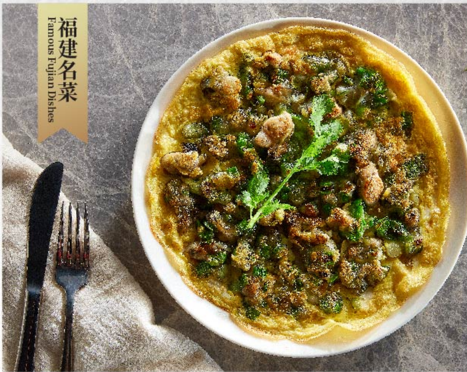
福建特色海蛎煎 Fujian Fried Oyster Omelette