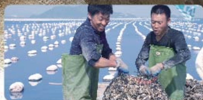
海蛎产地: 福建兴化湾江口港 Origin of oysters: Jiangkou Port, Xinghua Bay, Fujian.