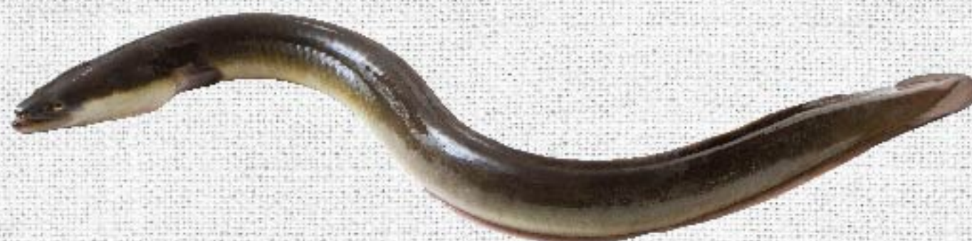
河鳗 Eel 时价 Market Price