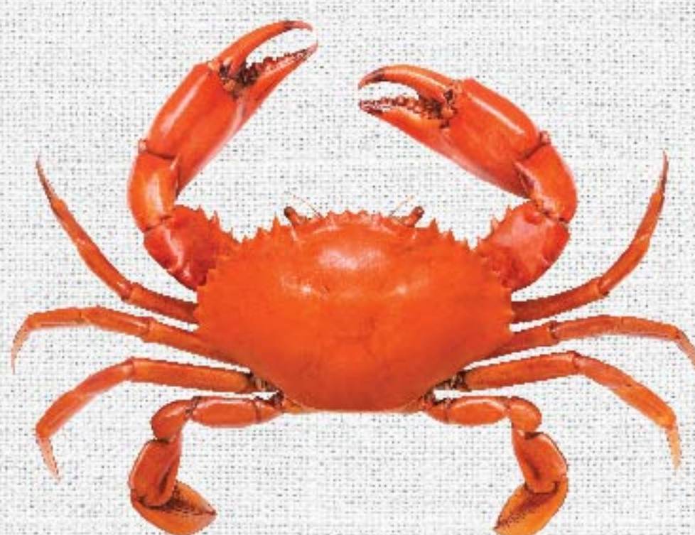
肉蟹 Mud Crab 时价 Market Price