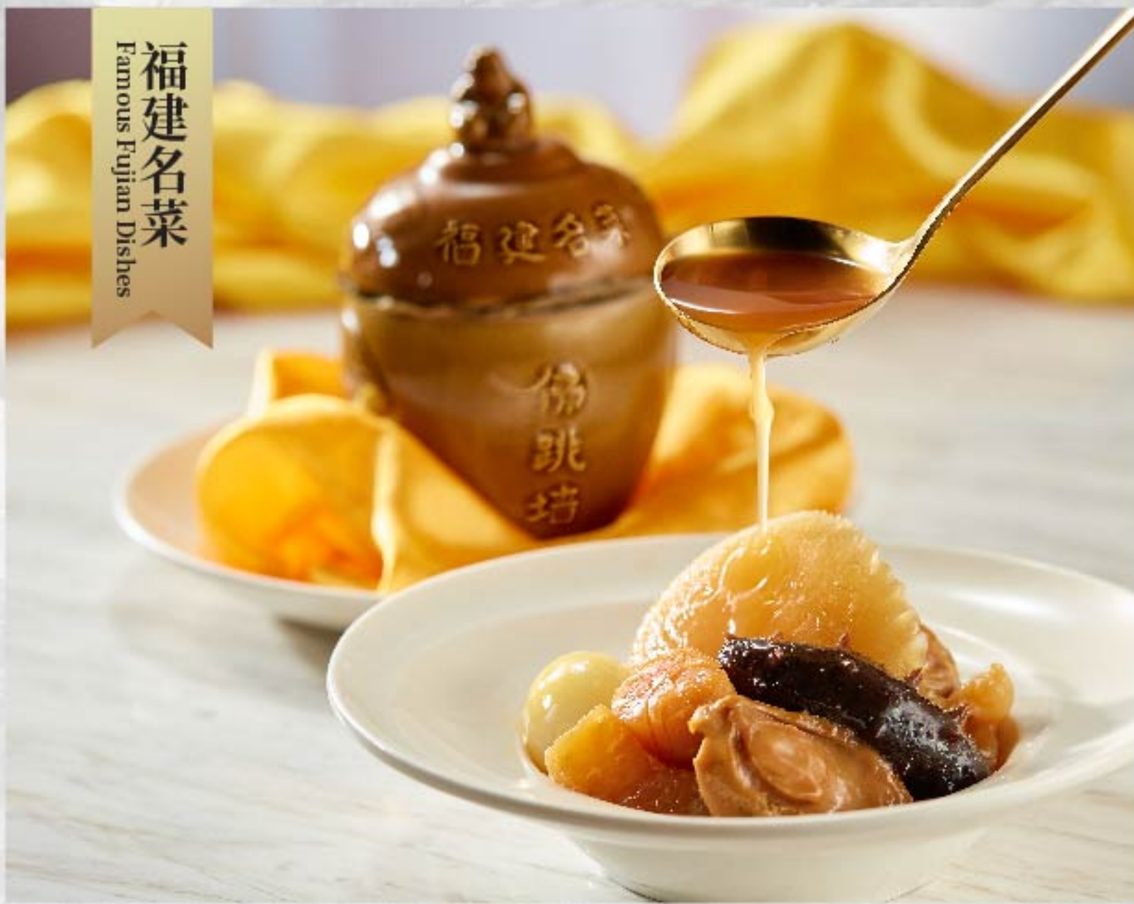
经典佛跳墙 Traditional Buddha Jumps Over the Wall