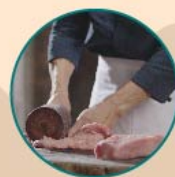
4 莆田涵江厚峰村 手打扁肉 Han Jiang District Hou Feng Village in Putian City Handmade Bian Rou