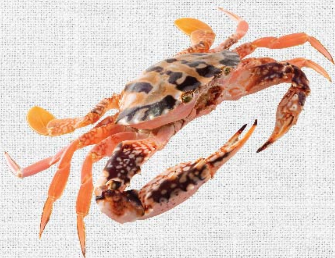
花膏蟹 Flower Crab 时价 Market Price