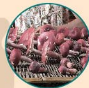
2 福建偏远山区，长汀 红菇 Changting-A Faraway Mountainous District in Fujian Red Mushroom